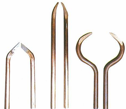
1. Ag-W tip type 2. Long type 3. Curved type